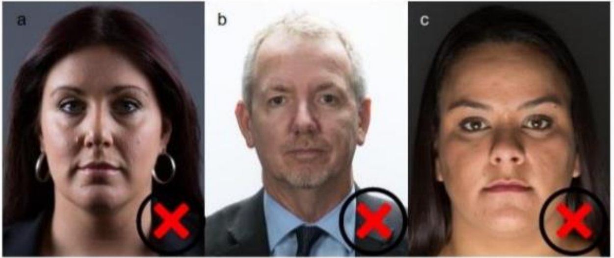
Non-compliant portraits: a) Side illumination, b) Top illumination, c) Bottom illumination.